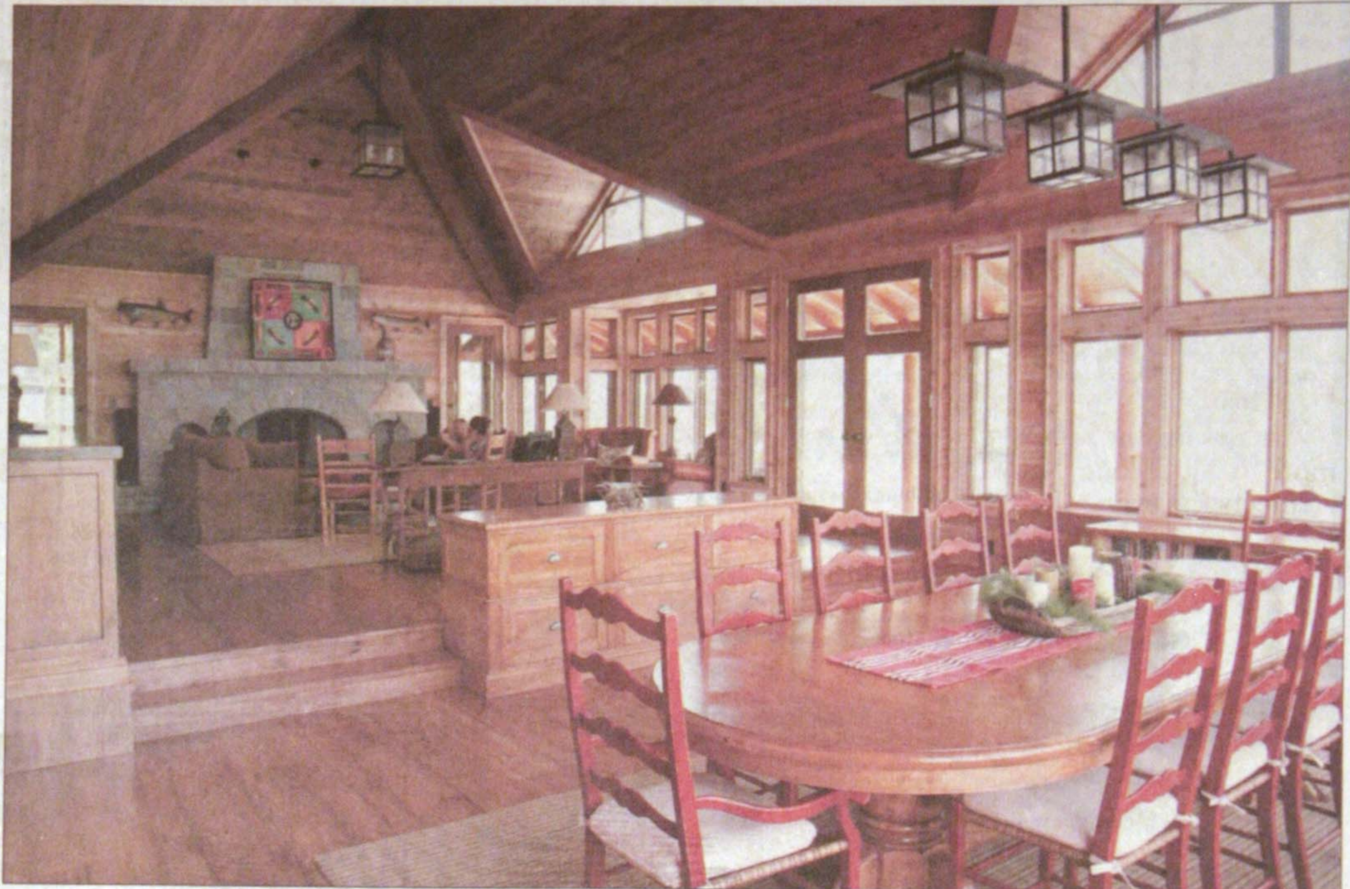
Above, an island cottage takes advantage of many views to surrounding rocks and water. Below, a large skylight floods this Muskoka kitchen with natural light.